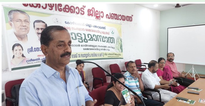
Inauguration of Naatumaampaatha by Shri. Thottathil Raveendran MLA