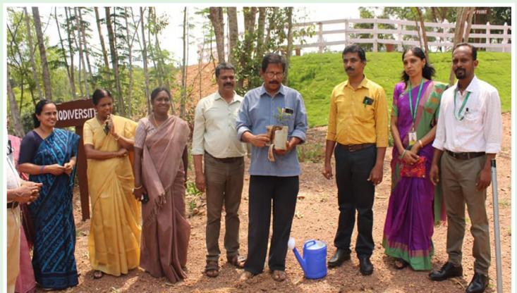
Inauguration of world environment day celebration