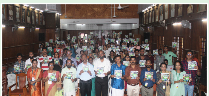
State level Inauguration of PBR updation campaign at Thrissur