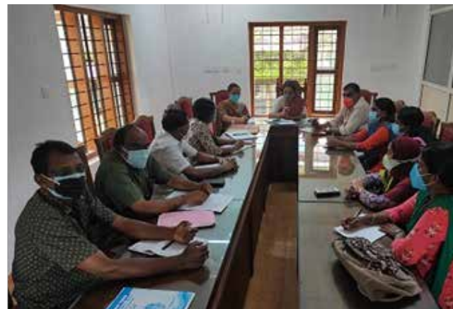
BMC Meet - Ranni-Angadi