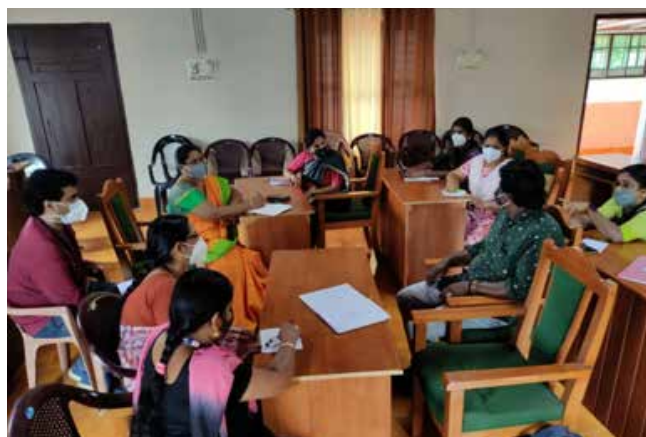
BMC Meet - Vadasserikkara GP