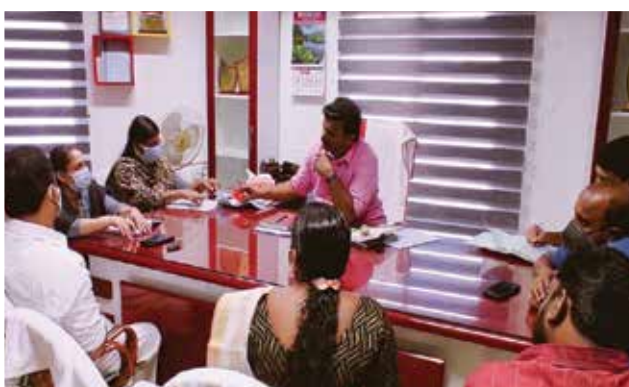
BMC Meet - Kadakkal grama panchayat