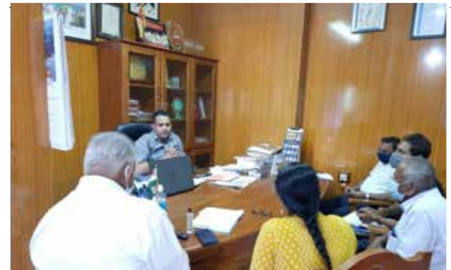
BMC Meet - Wayanad Jilla panchayath