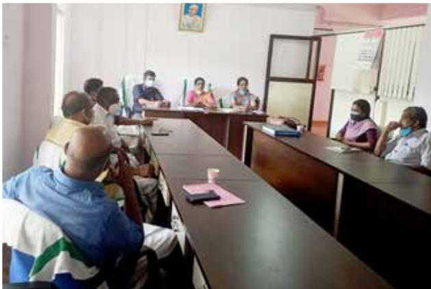
BMC Meet - Kudayathoor