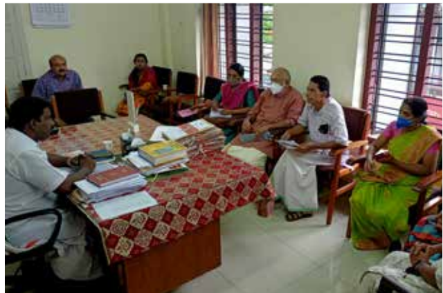
BMC Meet - Thodupuzha municipality