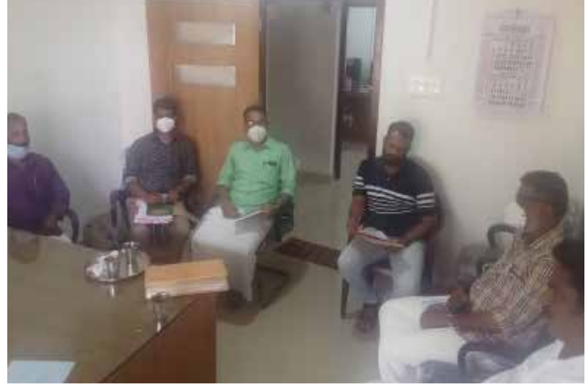
BMC Meet - Chowanur Block