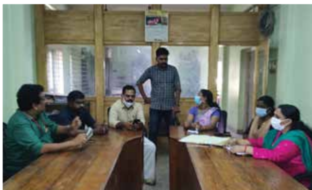
BMC Meet - Kalluvathukkal grama panchayat