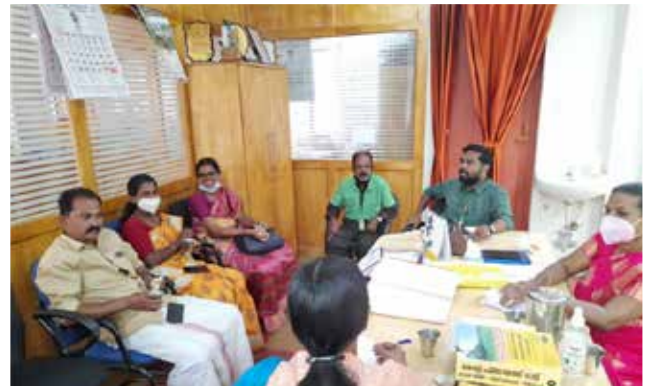
BMC Meet - Vilappil