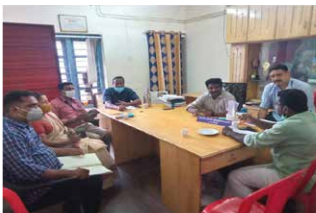
BMC Meet - Mannanchery