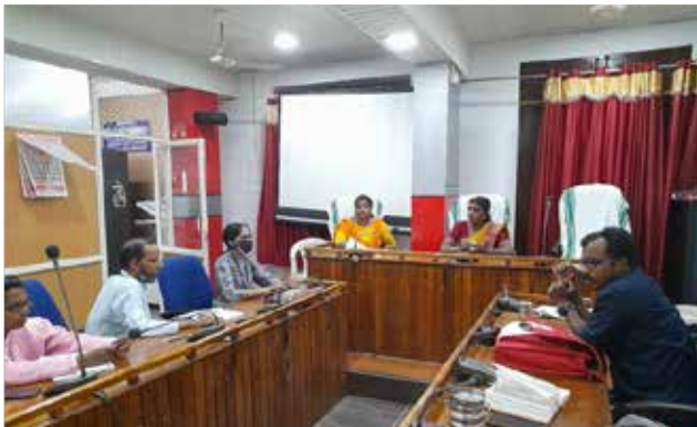
BMC Meet - Balaramapuram