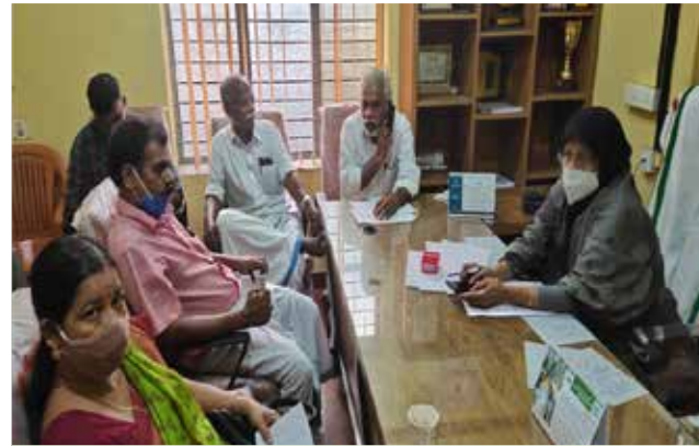
BMC Meet - Pandikkad GP