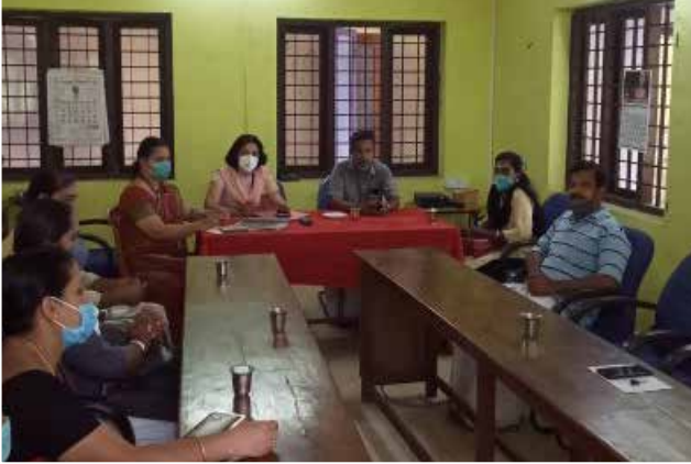
BMC Meet - Vallachira GP