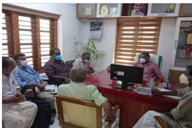
BMC Meet - Karuvatta